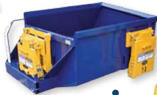
VBTL Curb/ TL Front Mount