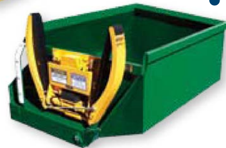
GTL Curb Mount