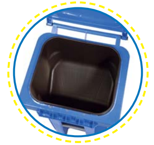
▲ 20-gallon insert in 35-gallon container for collection of recyclables and organics