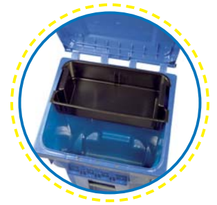
▲ 5-gallon insert in 65-gallon container for recycling glass